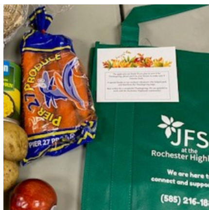
Thanksgiving baskets from JFS.