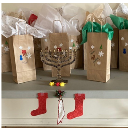
Holiday gift bags.